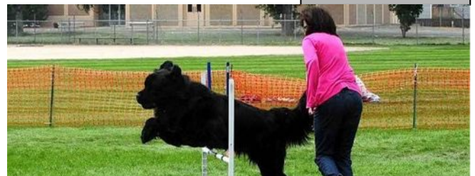
Patti Pigeon and Sully clear the last jump