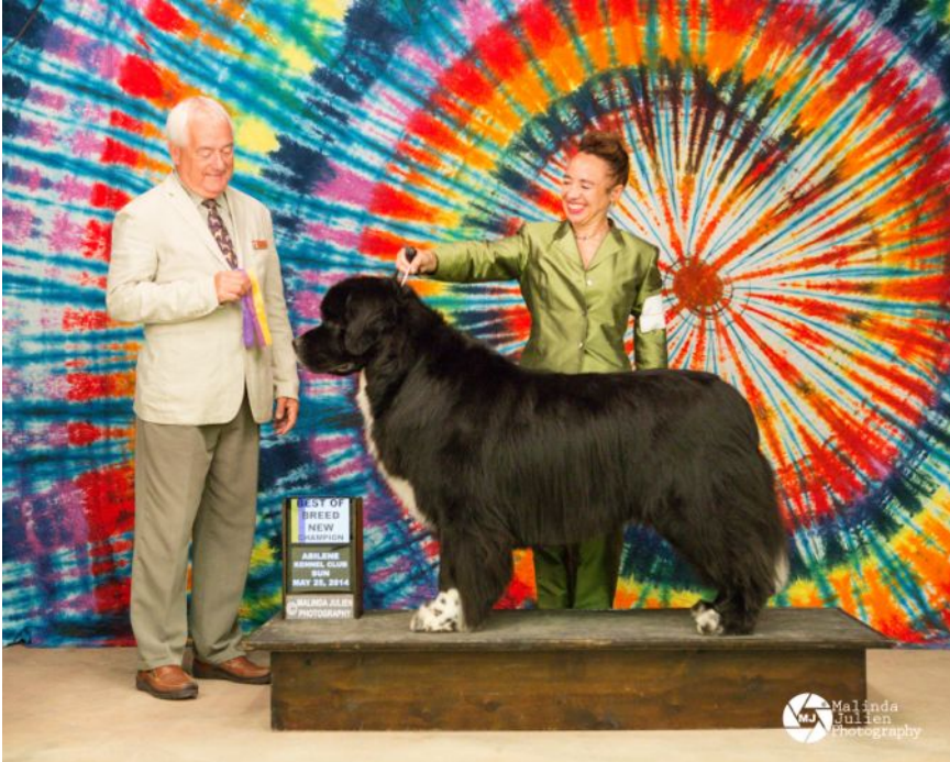
Magnum's CH pic in Abilene