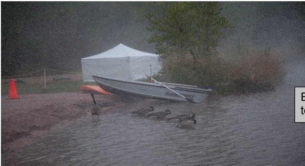
Even the Geese were too cold to swim!