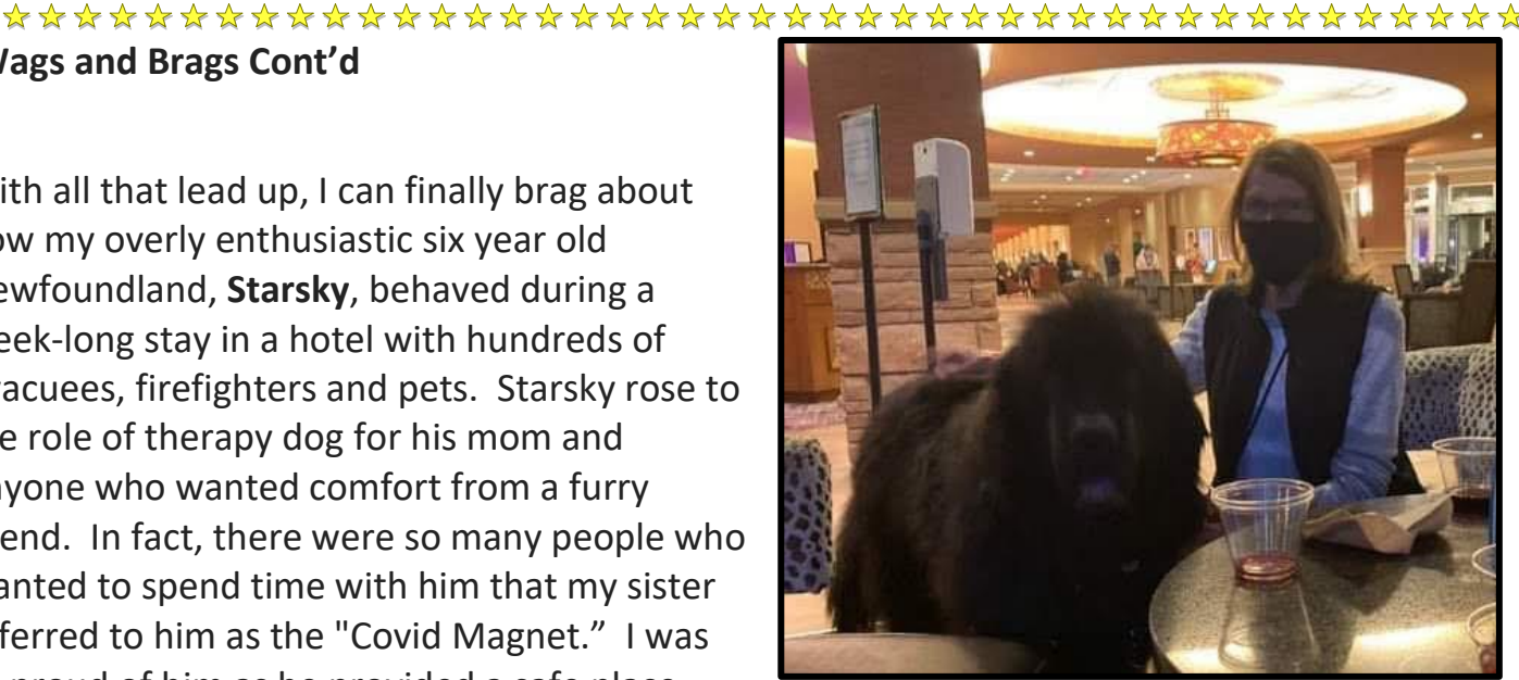
Starsky and I waiting to be able to return home

"We were literally surrounded by fires, Cameron Peak, the Boulder Fire and East Troublesome Thompson Zone. We were super lucky."