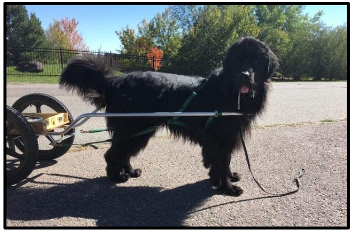
The Draft Test and Workshop are back