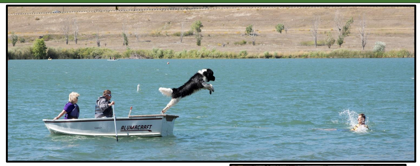
Two Water Tests announced for summer 2021