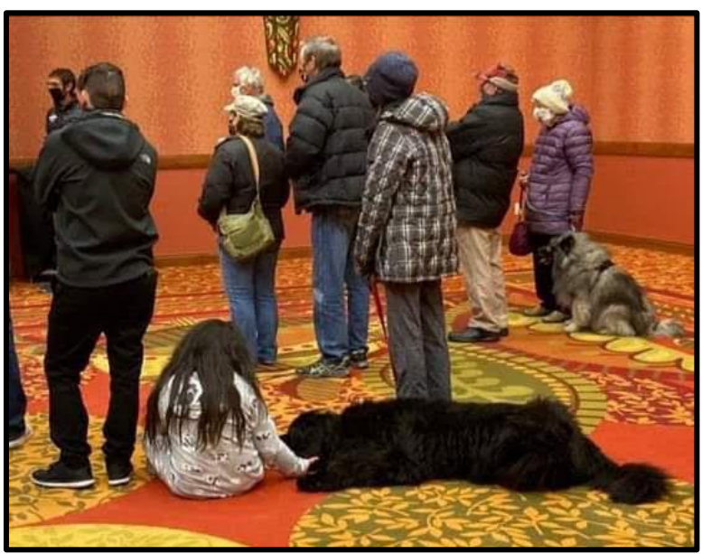
Starsky at work comforting evacuees

Although my suitcase was still packed from an evacuation order the prior week, by the time Starsky and I rendezvoused with the rest of my family, the situation had deteriorated. Between the residents and tourists attempting to evacuate Estes, the traffic in all three directions out of town was in a gridlock. With visions of the horrible evacuation videos from the California fires ruminating in my head, the hour and a half it took to drive one mile was truly frightening. Finally, the police were able to get traffic moving and we made it safely to the Embassy Suites in Loveland, CO. The fire never reached my