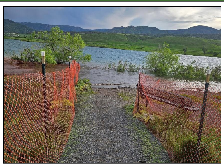
Chatfield Lake Gravel Pond, Spring 2023